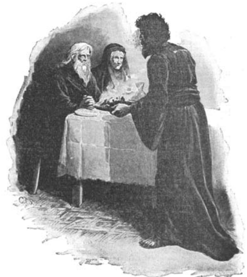
"Honor thy father and mother" -- Ex. vi. a.

First, children must be taught to 'listen to' their parents. At its core meaning , the biblical word used by Paul in verse one, ὑπακούω, insists that children pay close attention to the instructions of their parents. This must be enforced through disciplining of the children when they refuse. Children need boundaries as